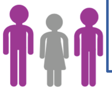
male to female ratio in youth shelters