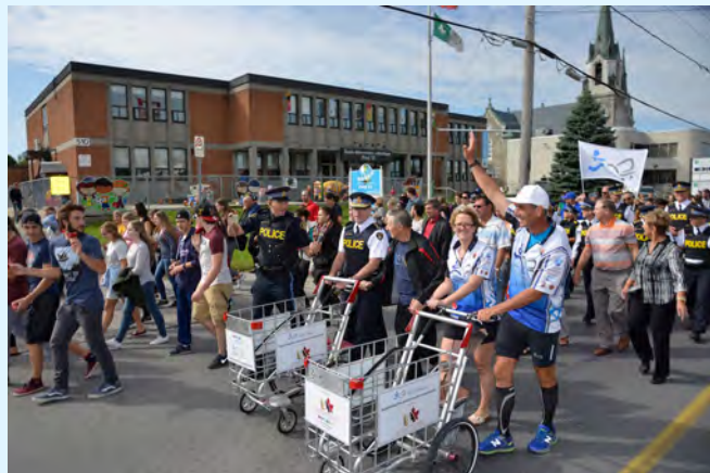
Walk into Hawkesbury, Ontario from Quebec border, September 22, 2016