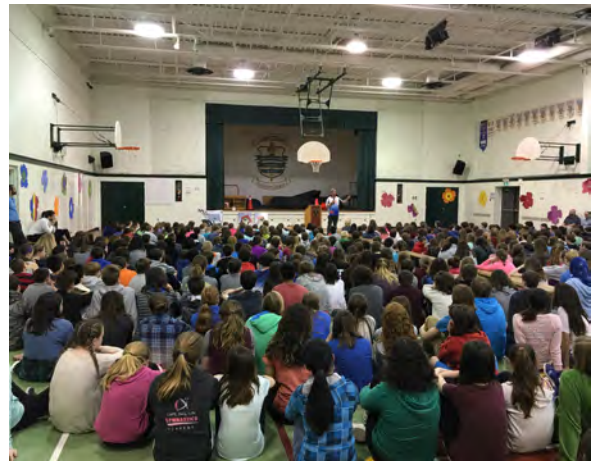
School presentation: Malcolm Munroe Memorial Jr High School, Sydney, NS

2:00-7:00 pm School and Community engagements