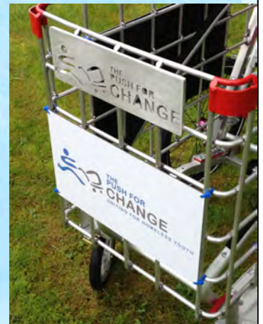
The Shopping Cart

The Push for Change offers strong opportunities for youth empowerment. Before, during, and after Joe speaks, students and teachers will be invited to get involved in The Push for Change through social media, interactivity and a number of hands on fun(d)raising activities- some of which will be competing against other schools across Canada.