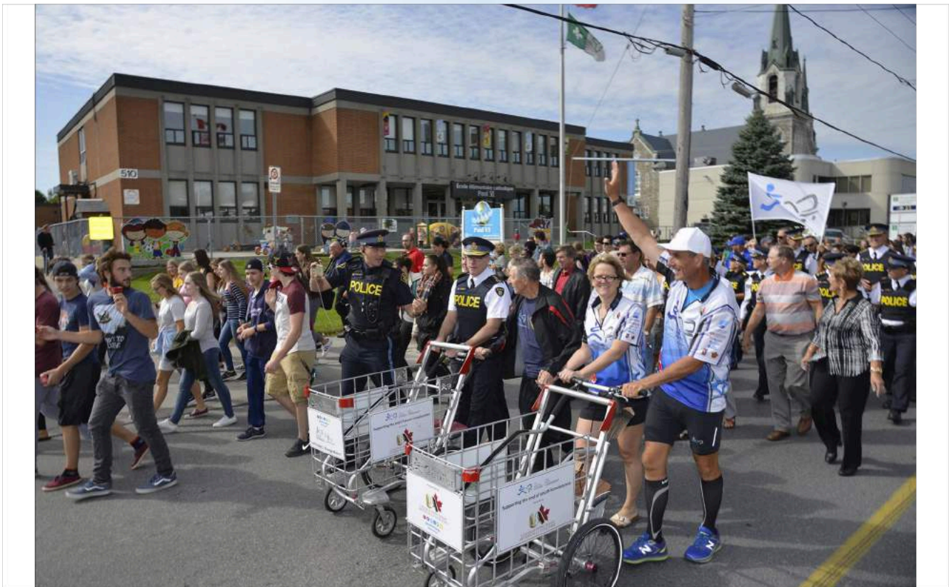
Entering Ontario through Hawkesbury, September 22, 2016